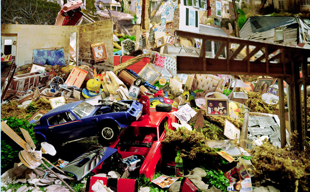
Wardell Milan, One could still dream to devise an optimistic antidote , 2008, Digital c-print photograph 40 x 50in

for New Haven Public High School Students